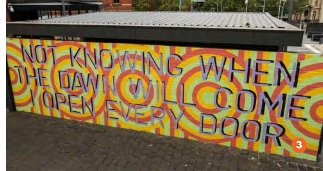
3 Annexe Wall Ongoing – commissioned annually Various Artists Alfred Deakin Place, Camp Street