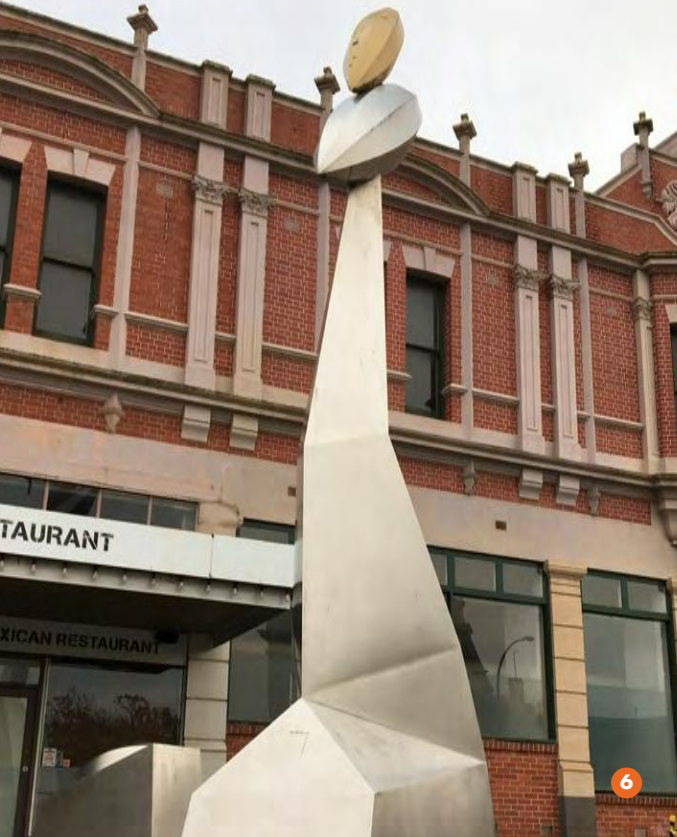
6 Point to Sky 1999 Akio Makigawa Corner Sturt & Camp Streets

Point to Sky is one of Akio Makigawa's final works, the commission was completed posthumously. It is the only public artwork by the celebrated Australian-Japanese sculptor of this scale located in regional Victoria. You will see two stainless steel forms, a smaller more rectangle form and the towering geometric form, with seed pod shapes at the peak. These forms represent the house, the artist is expressing that home is a shelter and also a place for gathering. The house form grows into a tower to symbolise the achievements of mankind and the action taken to protect the rights of the community during the Eureka Stockade. The top seed pod is gold, referencing Ballarat as the centre of the gold rush in Victoria, as well as representing the sun as the source of life. The paving of the forecourt was designed in bluestone, typical of the work of Makigawa.