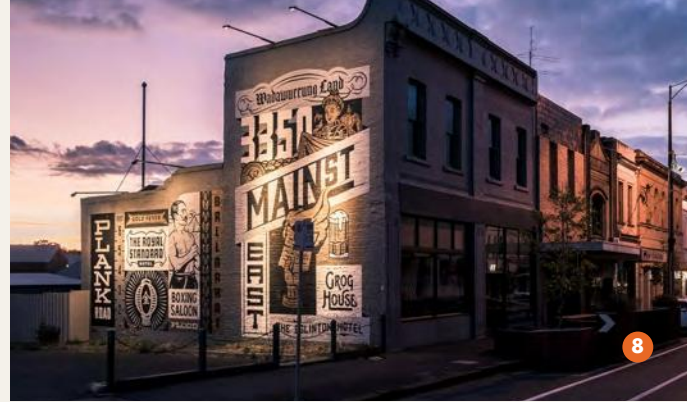
8 Main Road Mural 2018 Travis Price Main Road and Humffray Street South

Point to Sky is one of Akio Makigawa's final works, the commission was completed posthumously. It is the only public artwork by the celebrated Australian-Japanese sculptor of this scale located in regional Victoria. You will see two stainless steel forms, a smaller more rectangle form and the towering geometric form, with seed pod shapes at the peak. These forms represent the house, the artist is expressing that home is a shelter and also a place for gathering. The house form grows into a tower to symbolise the achievements of mankind and the action taken to protect the rights of the community during the Eureka Stockade. The top seed pod is gold, referencing Ballarat as the centre of the gold rush in Victoria, as well as representing the sun as the source of life. The paving of the forecourt was designed in bluestone, typical of the work of Makigawa.