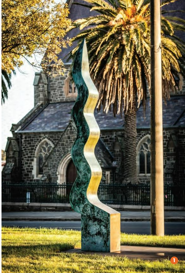
1 Eternal Flame 1995 Peter Blizzard Sturt St - Between Lyons & Dawson St

Eternal Flame was created by renowned Ballarat sculptor Peter Blizzard as a marker of the end of WWII in the Pacific. Engraved into the bluestone shaped tile across the base of the statue is details about conflict areas where Australian Troops were active. The metal structure mimics a moving flame with its polished golden hue, a feature included in many war memorials around the world. Peter Blizzard also designed the Prisoner of War Memorial in the South Gardens, Ballarat Botanic Gardens.